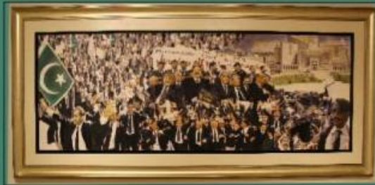
Lawyers Struggle for Independent Judiciary

To enrich our collections all relevant avenues have been targeted and our collection is increasing day by day and Museum is progressing with its objective, exploring the past, engaging the present and educating the future.