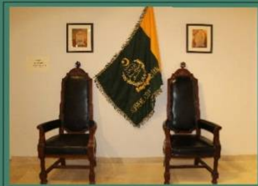
Chairs used by Hon'ble Judges 1960-1970