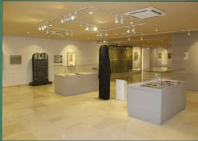
Evolution of Law Gallery-I