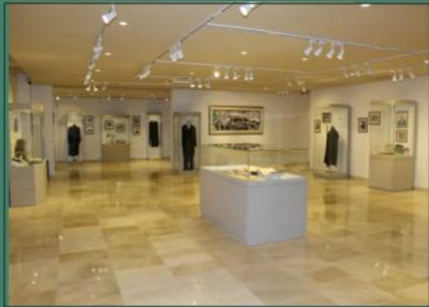
Chief Justices & Judges Gallery-II