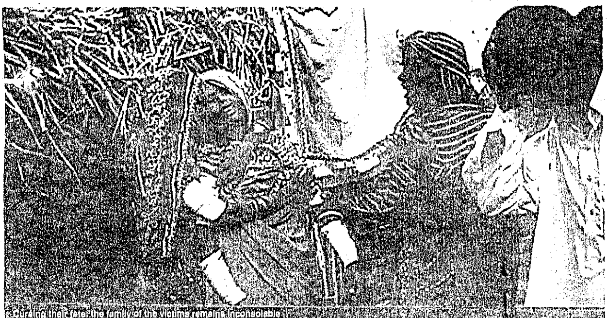
During their stay, the family of the victims remain inconsolable.